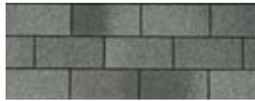
NW Harvard Slate